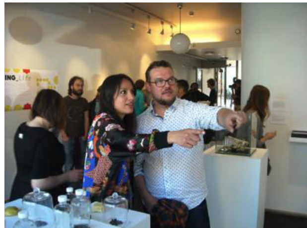
At the Making_Life Exhibition

A group of 29 Finnish and international participants composed of artists, designers, architects, engineers, scientists and Aalto University students cooperated within the MAKING_LIFE program. The methods shifted from workshops, laboratory sessions and field trips, to forums, seminars and lectures. It comprised theoretical as well as hands on approaches.