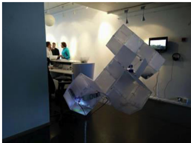
Starbeasts – Making_Life Exhibition

Markus: Although the current capabilities of synthetic biology are still limited, it is not unreasonable to think of a future where the magnitude and depth of the changes we exert on living organisms is going to increase significantly. The higher the options to modify biology, the less will the modification be dictated by technical constraints but more by (socio-)economic pressure and to some degree by ethical considerations. The first applications are directed to make currently inefficient, expensive and unsustainable production processes more efficient, cheaper and more sustainable. Examples are the production of pharmaceuticals (e.g. the anti-malaria compound artemisinin, antibiotics), other fine chemicals of interest (e.g. colour, aromas, skin lotion) or biofuels by microorganisms. In most of these cases the ethical issues are confined to socio-economic questions (access and benefit sharing, consumer rights, land use change) and environmental issues (biosafety of unintended release).