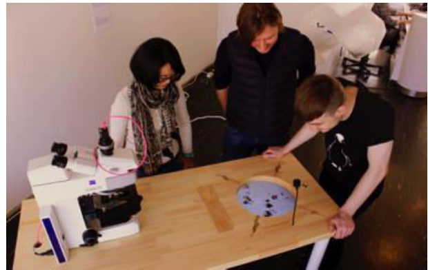
Your Synthetic Future – Making_Life Exhibition

If you look at the way how a genetically modified organism (GMO) is defined in Europe, then there is (in most cases) no qualitative difference to traditional genetic engineering. In Europe a GMO is an organism that has been modified by introducing genetic elements from