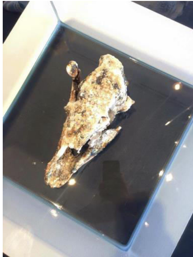
Vanitas – Making_Life Exhibition